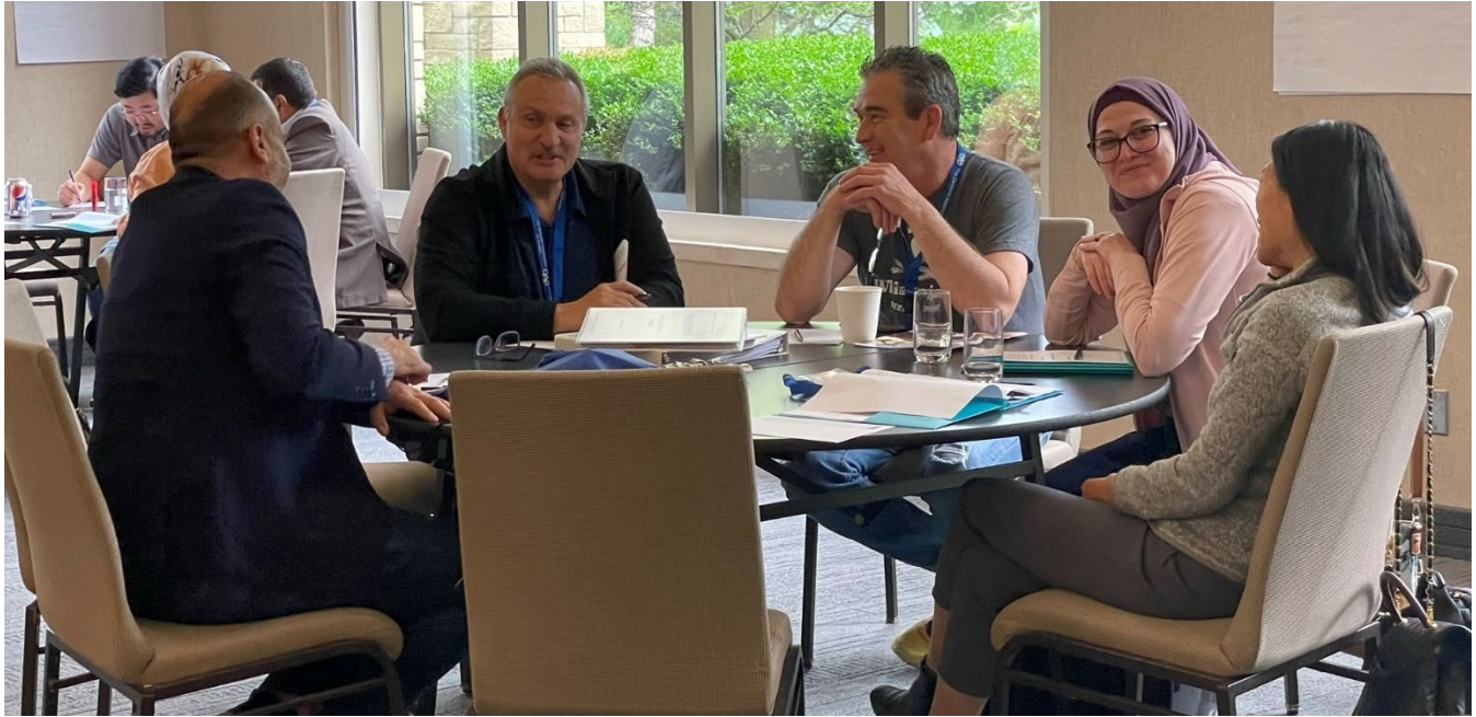
Peer Circle Group Participants at the DAO event on June 16, 2023