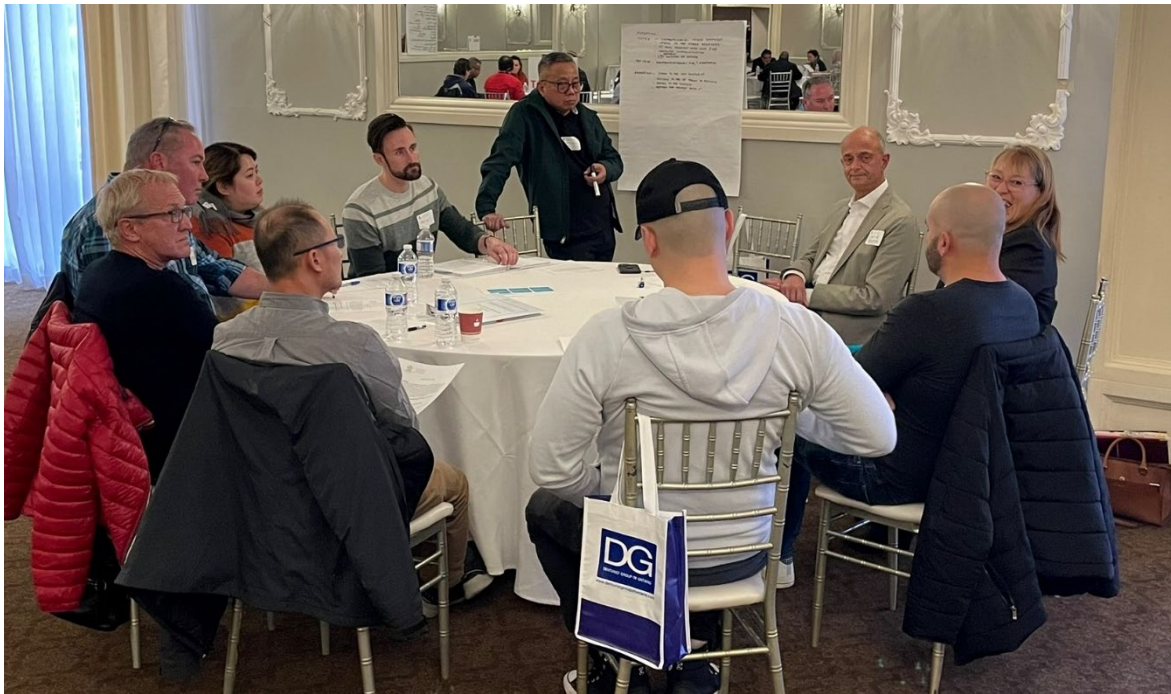
Peer Circle Group participants at the DGO Conference on November 2, 2023