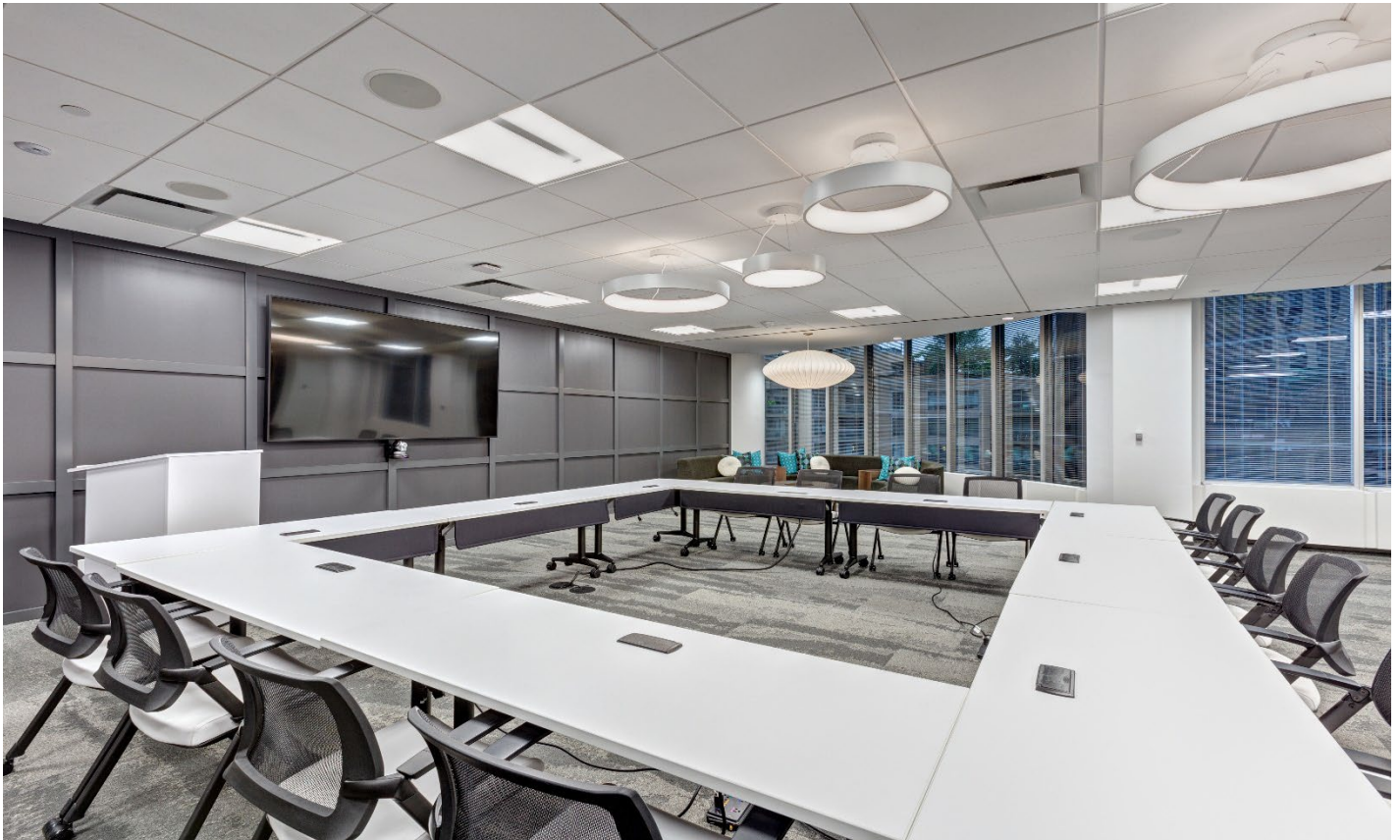
HUB 601 Council Chambers